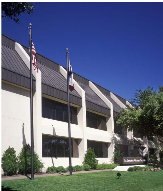
SWEPCO's world headquarters, Fort Worth, Texas.